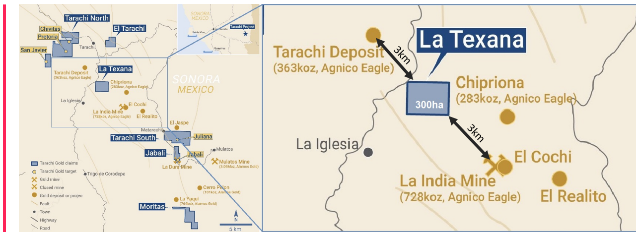
Figure 1 - Map of Tarachi Concessions in Sonora, Mexico

The La Texana concession is 300 hectares in size and located within the Sierra Madre Gold Belt. This section of the Sierra Madre is host to numerous gold deposits and active gold mines along a northwest-southeast trend. La Texana is situated midway between Agnico Eagle’s La India mine and the undeveloped Tarachi Deposit.