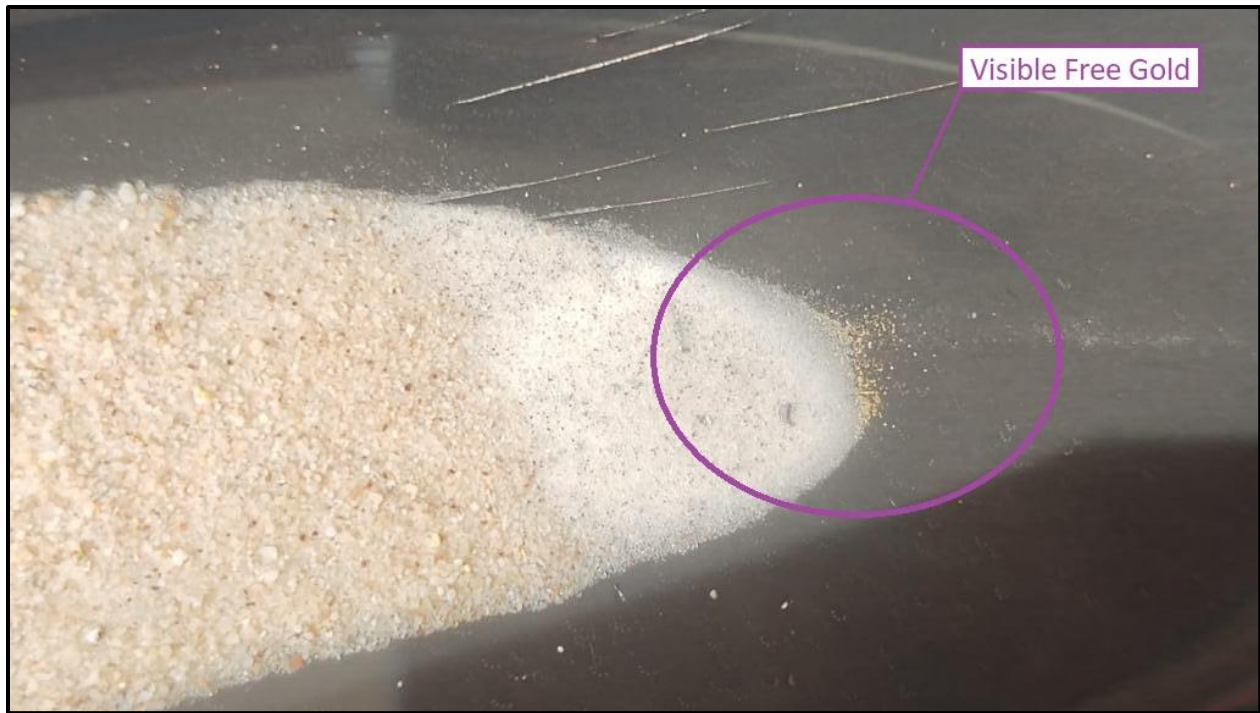
Figure 2 - Visible Gold Panned from Hole JAB-21-014